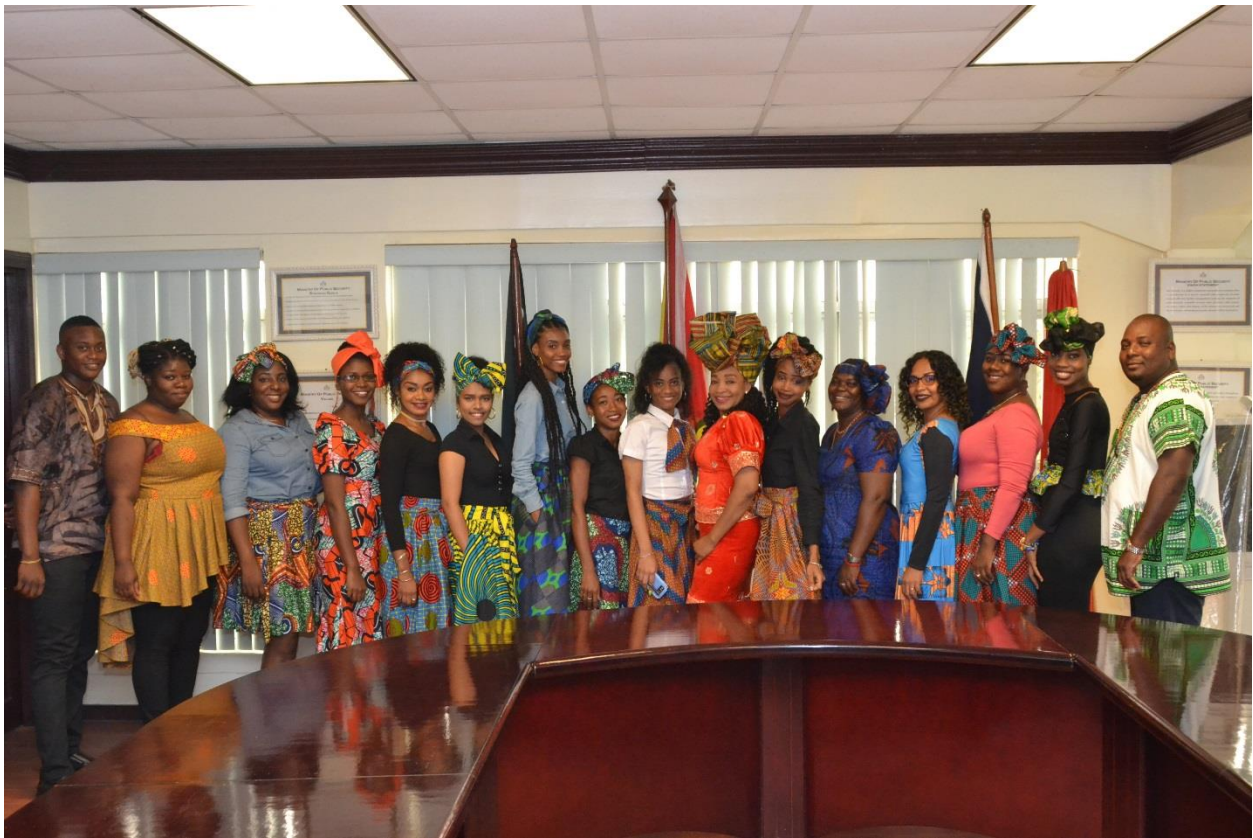
Ministry of Public Security Staff Pre- Emancipation Wear

Happy Pre-Emancipation to all of Guyana from the Ministry of Public Security