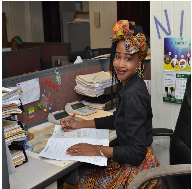
Pre- Emancipation at the Ministry of Public Security