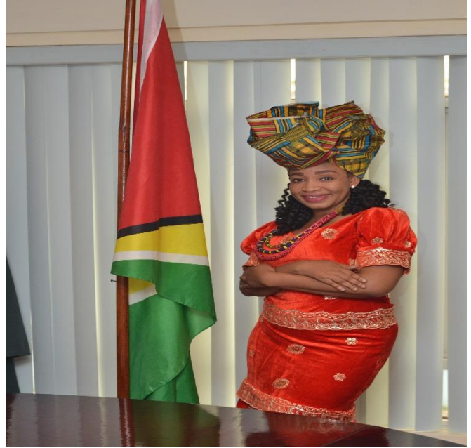
Pre- Emancipation at the Ministry of Public Security