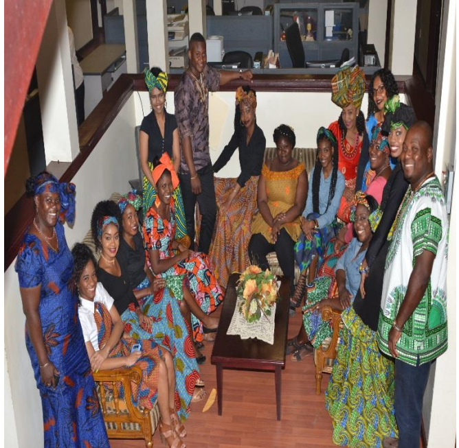
Pre- Emancipation at the Ministry of Public Security